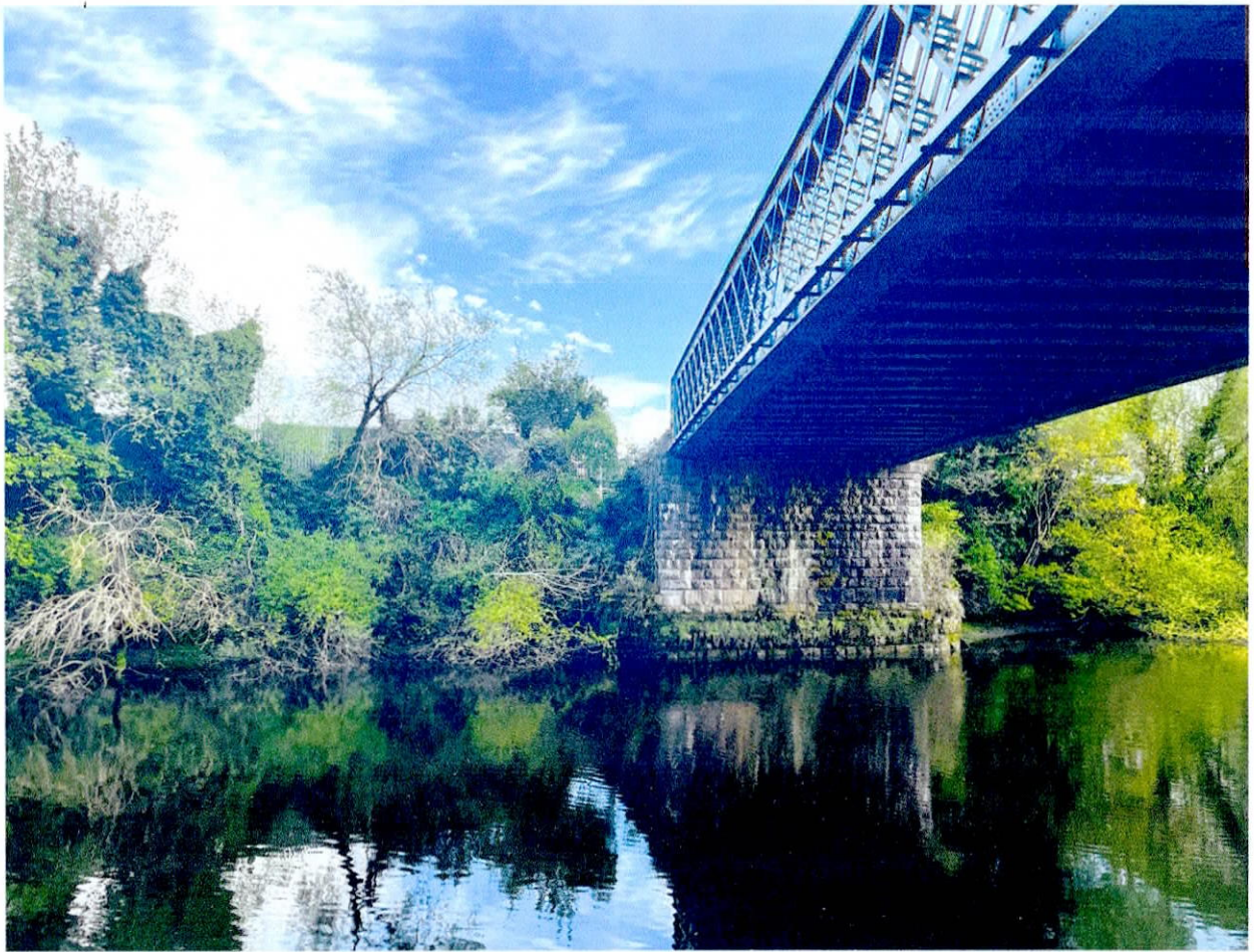
Embankment immediately adjacent to the existing Liffey Bridge (on the Heuston Station side of the river)