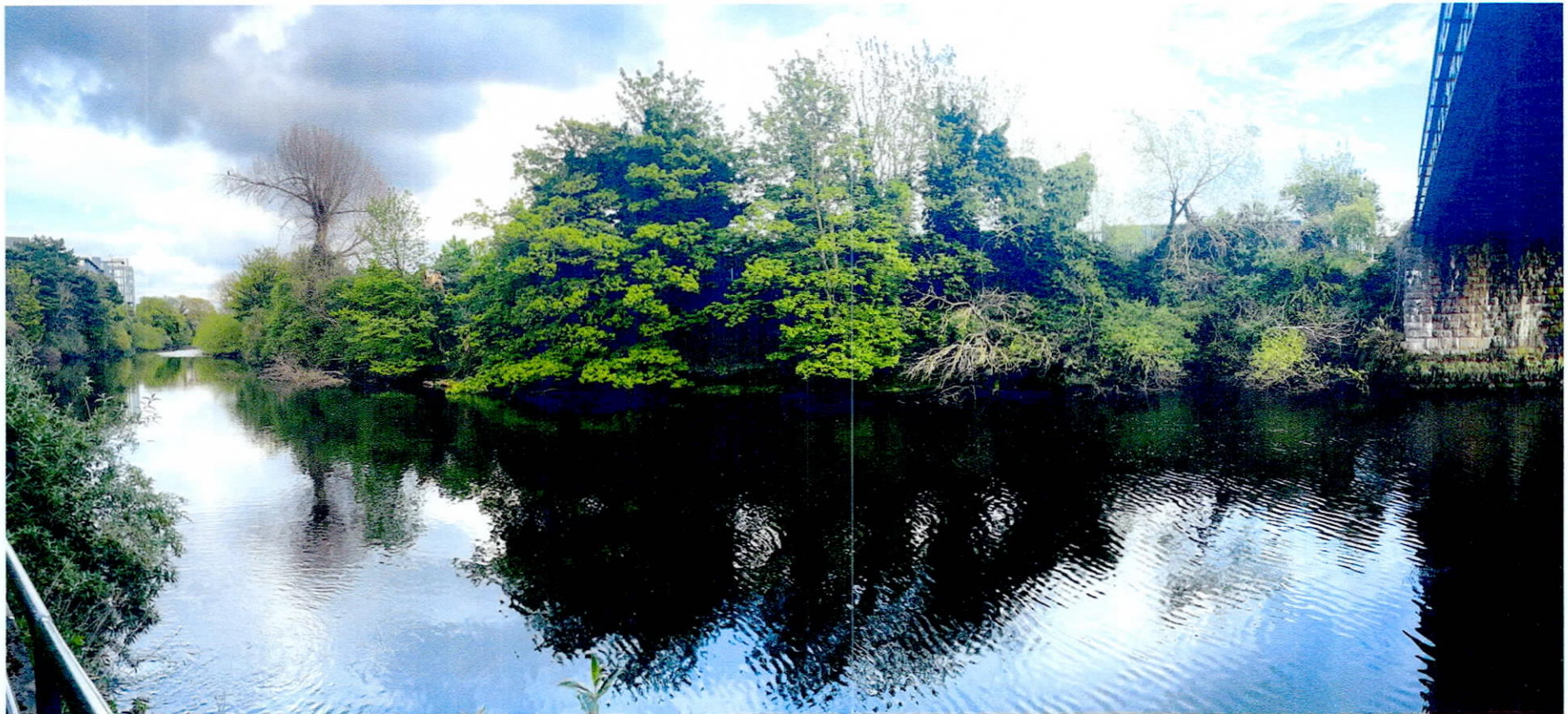
Panoramic view back up along the river towards the city centre, looking from Riverpark Apartments across to the backyard of Heuston Station